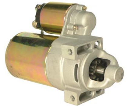
SDR0291 FOR KOHLER, PMGR; 12-VOLT; CCW; 10-TOOTH; LESTER 6744; PIC 140-6051; USED ON KOHLER REPL.: 10455513, -6; 25-098-08, -08S, -09, -09S; AM132702