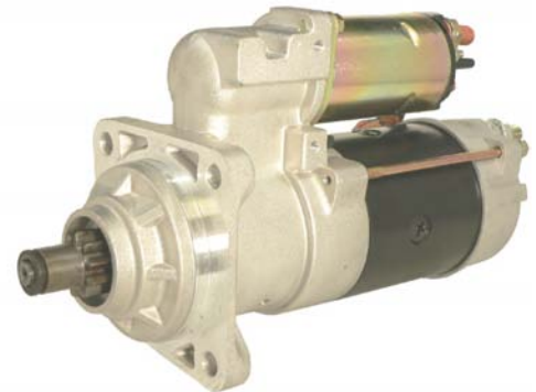
SDR0279 FOR 29MT SERIES, OSGR; 12-VOLT; CW; 10-TOOTH; LESTER 6844; PIC 141-460; USED ON INTERNATIONAL TRUCKS REPL.: 19011409; 10461765; 4C4Z-11002-CA