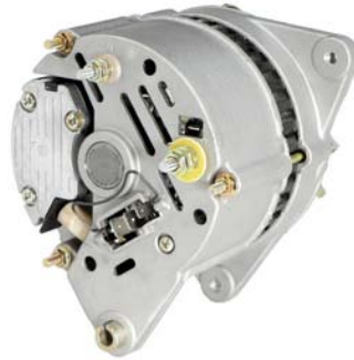
ALU0025 IR/EF; 12-VOLT; 70 AMP; LESTER 12096; PIC 280-327; USED ON FORD, MASSEY FERGUSON REPL.: 24400; 54022560, 54022561; 63324400; 3714-922-M, 3714-944-M