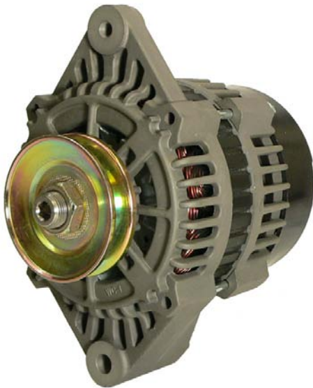
ADRO298 FOR 7SI SERIES, 12-VOLT; 70 AMP; LESTER 8466; PIC 240-6312A; 1-V PULLEY; USED ON CRUSADER, PLEASURECRAFT REPL.: 19020608; 1-2484-01DR