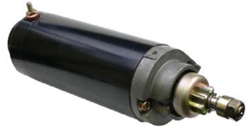
SAB0129 FOR MERCURY, 12-VOLT; CCW; 8-TOOTH; LESTER 5773; PIC 106-065; USED ON 2.5L ENGINES REPL.: 50-832997, -1, -2; 6782140-M030SM