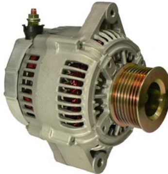
ANDO220 IR/IF; 12-VOLT; 140 AMP LESTER 12195; PIC 290-189; USED ON FORD TRACTORS, JOHN DEERE REPL.: 100211-6420; RE46608