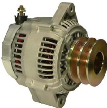
ANDO221 IR/IF; 12-VOLT; 120 AMP LESTER 12066; PIC 290-405; USED ON JOHN DEERE REPL.: 100211-6030, -1, -6050, -1; RE36246, -37201, -42123, -44140, -51921