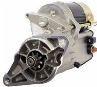
SND0158 OSGR; 12-VOLT; CW; 9-TOOTH

REPL.: MITSUBISHI M1T86081; GENERAL MOTORS 30024598; SUZUKI 31100-65DB0