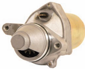
SCH0026 FOR ATV'S & SCOOTERS BUILT IN CHINA, 12-VOLT; CCW; 14-TOOTH;

LESTER 19583; PIC 199-083; Used on 150cc Engines