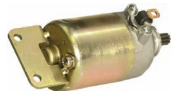
SCH0014 FOR ATV'S & SCOOTERS BUILT IN CHINA, 12-VOLT; CW: 9-SPLINE

LESTER 19579; PIC 199-079; Used on 80cc Engines