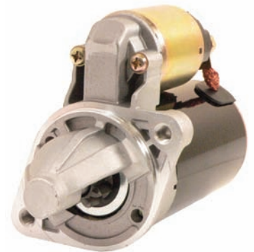
SPR0012 PMDD; 12-VOLT; CW; 8-TOOTH

REPL.: DENSO 228000-4390, -1; TOYOTA 28100-20553-71