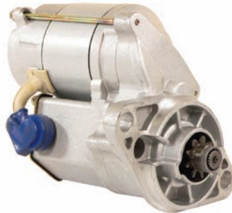
SND0461 OSGR; 12-VOLT; CW; 9-TOOTH

REPL.: DENSO 128000-4420, -5780; TOYOTA 28100-16020, 27060-16110, 27060-16120