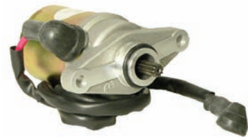
SCH0010 FOR ATV'S & SCOOTERS BUILT IN CHINA, 12-VOLT; CCW: 10-SPLINE

LESTER 19576; PIC 199-076; Used on 50cc Engines