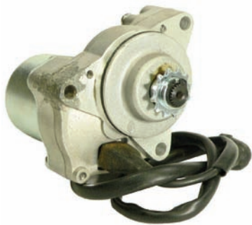
SCH0007 FOR ATV'S & SCOOTERS BUILT IN CHINA, 12-VOLT; CCW: 12-SPLINE

The information herein is based upon data which we believe to be correct and believe to have been obtained from reliable sources, but no representation is made herein, nor should any be implied, regarding the accuracy of any such information and we assume no liability for any errors or omissions in any such information. Any original equipment manufacturers or other manufacturers or distributors, whose names, numbers, pictures, symbols, products and/or descriptions are, or may be, listed or shown herein are used for reference purposes only and there is no representation made or intended, nor should any be implied, that any item reference herein is the product of, or was manufactured and/or distributed, by, the referenced manufacturer or distributor, as the case may be. 4/08-III This brochure is intended for reference purposes only. For pricing or terms and conditions, please refer to your price sheet.