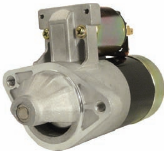
SMT0270 PMGR; 12-VOLT; CW; 8-TOOTH

LESTER 17837; PIC 103-5014; Used on: 2000-03 Chevrolet Tracker w/2.0L 2004 Chevrolet Tracker w/2.5L 2000-03 Suzuki Vitara w/2.0L